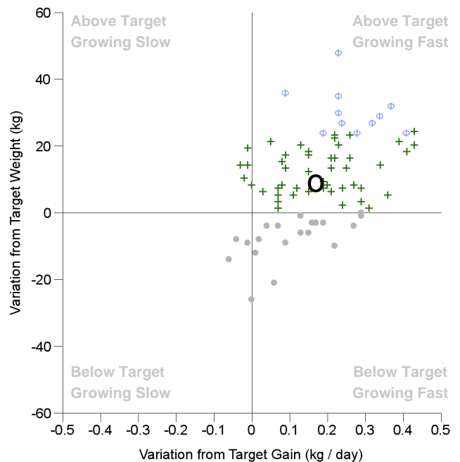
Variation from Target Weight and Target Gain